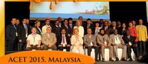
ACET 2015, MALAYSIA

Sustained patronage of CPSC Customized Programs by MCs and non-MCs