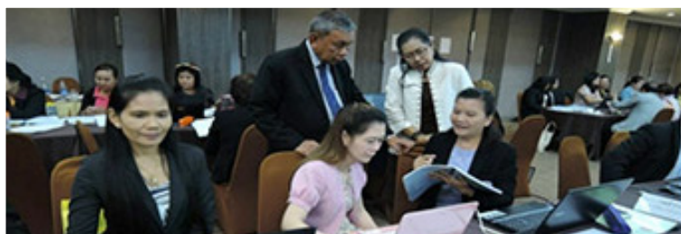
Participants during the group activity