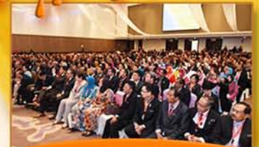
IVETA WORLD TVET CONFERENCE 2015