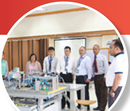
Courtesy call to the officials of MFI and tour of their Headquarters and Facilities.

The delegation visited TVET institutions such as the MFI Foundation and the Jacobo Z. Gonzales Memorial School of Arts and Trades (JZGMSAT) to better expose themselves in the workings of a TVET institution in the Philippines. They also visited the headquarters of Toyota Motors Philippines to know how the industry participates in the employment of TVET graduates. Lastly, they made a courtesy call to the officials of Technical Education and Skills Development Authority (TESDA) and initiate formal arrangements to establish linkages. TESDA is a Philippine government agency tasked to manage and supervise technical education and skills development in the country. The Bhutanese officials also visited the TESDA Women's Center (TWC) to observe some of the technical programs specifically designed for women trainers.