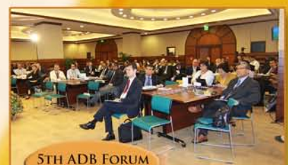
5TH ADB FORUM