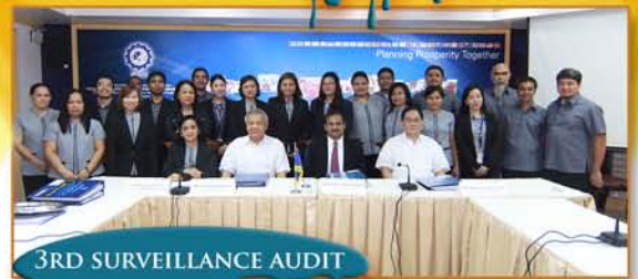
3RD SURVEILLANCE AUDIT

3-Year ISO 9001:2008 Recertification marked CPSC's 15th year as ISO-certified org