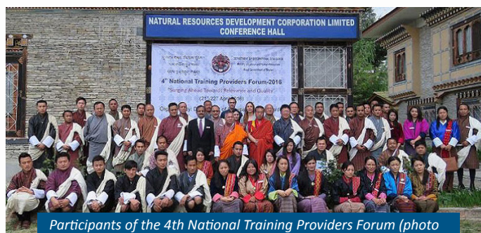
Participants of the 4th National Training Providers Forum