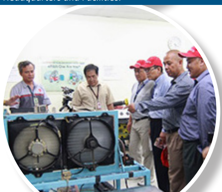
Visiting the facilities of Toyota Motors Philippines School of Technology in Santa Rosa, Province of Laguna.