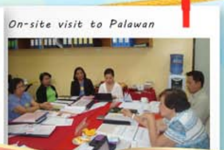
On-site visit to Palawan

APACC Invigorated Accreditation and Certification Activities