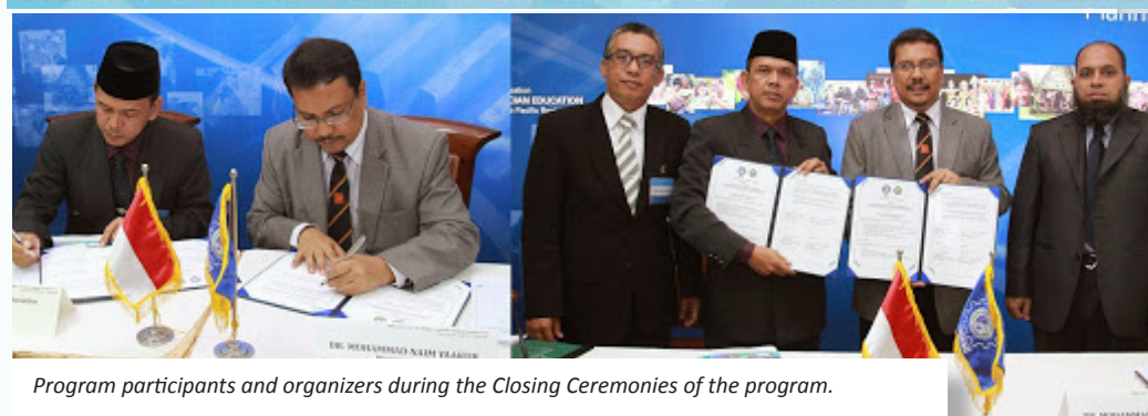
Program participants and organizers during the Closing Ceremonies of the program.