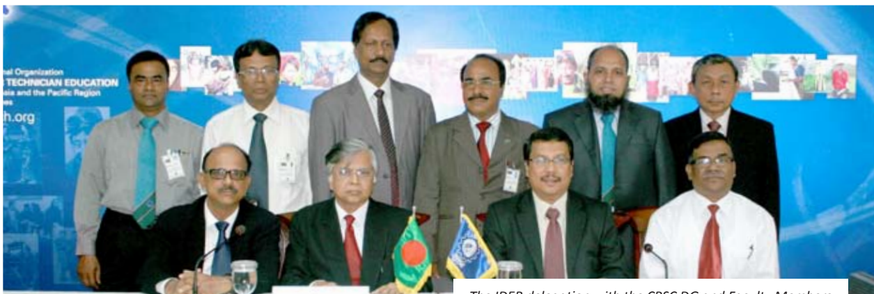
The IDEB delegation with the CPSC DG and Faculty Members.

A s a testament to the growing network of institutions seeking linkages with the Colombo Plan Staff College (CPSC) and keeping in mind the advocacy on the development of the human resources for economic prosperity, seven high-level officials from the Institution of Diploma Engineers (IDEB), Bangladesh visited CPSC on June 19, 2014.