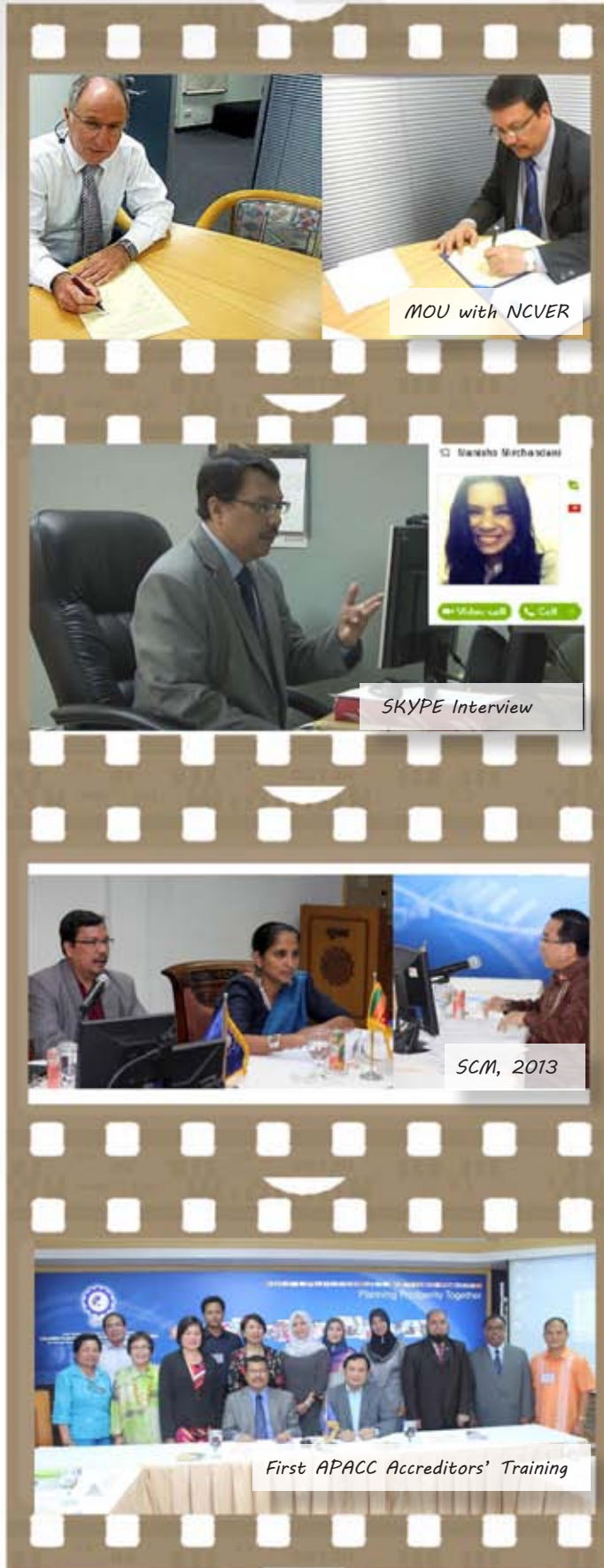
MOU with NCVET