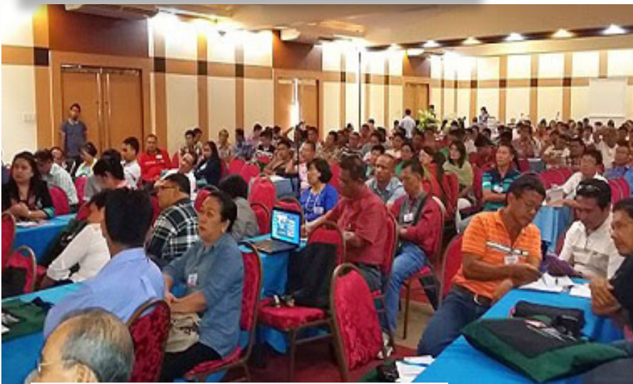
Attendees listen to speakers during the conference.

Maintaining ties and collaborative activities with the Philippine Association of Colleges and Universities of Industrial Technology (PACUIT), Inc., the Colombo Plan Staff College, co-organized PACUIT's 12th National Conference with the University of Southeastern Philippines (USEP) held at the Ritz Hotel in Davao City, Philippines from April 28-30, 2014. The conference is an annual event of PACUIT. This year's conference revolved around the theme "Technology Development and Transfer: An Economic Intervention for Poverty Reduction".