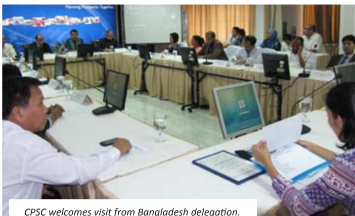
CPSC welcomes visit from Bangladesh delegation.