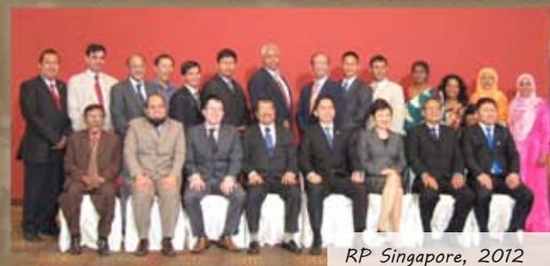
RP Singapore, 2012