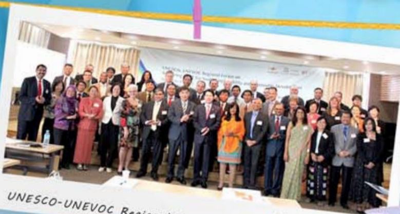
UNESCO-UNEVOC Regional Forum