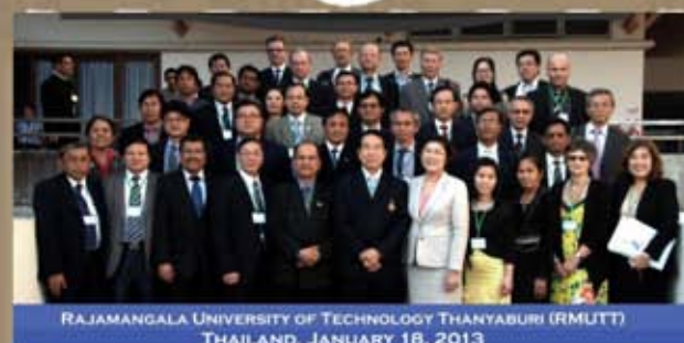
RAJAMANGALA UNIVERSITY OF TECHNOLOGY THANYABURI (RMUTT) THAILAND, JANUARY 18, 2013