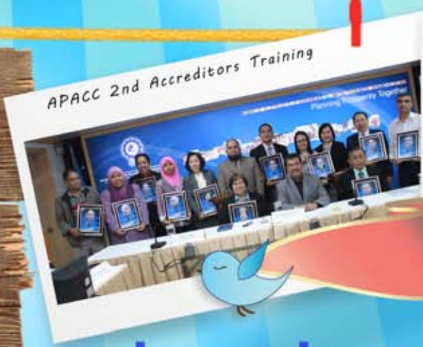
APACC 2nd Accreditors Training