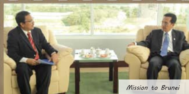
Mission to Brunei