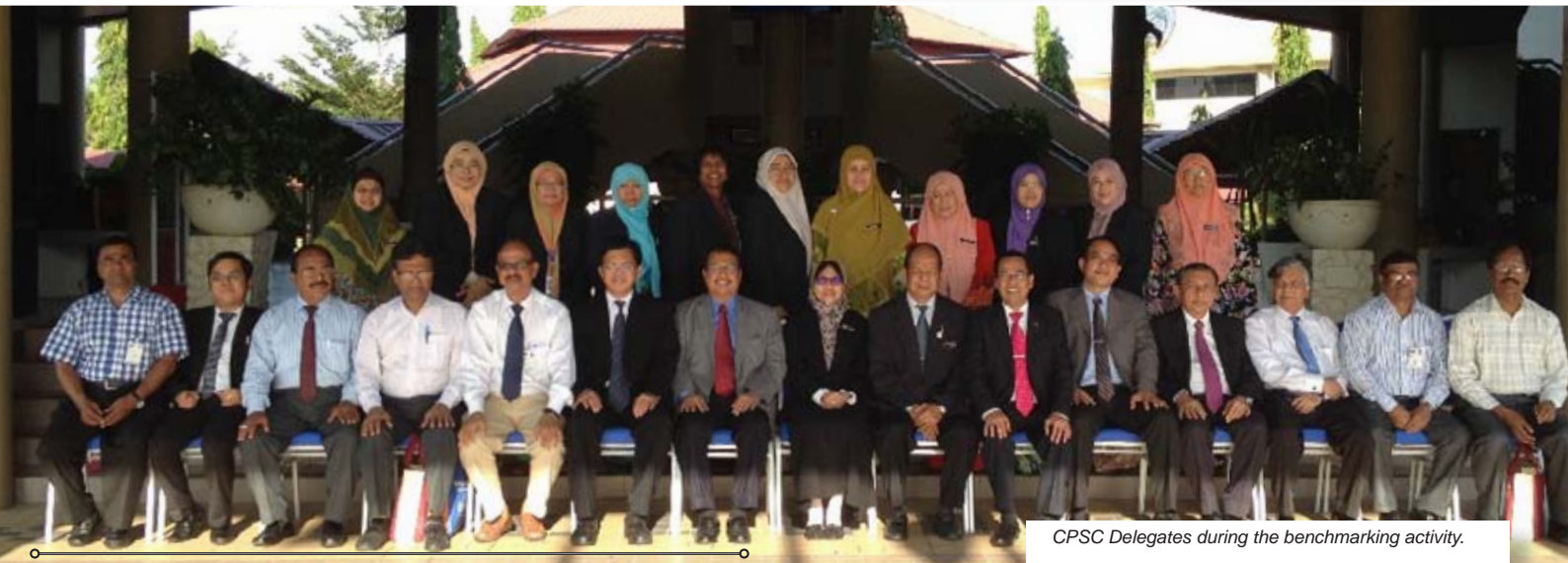
CPSC Delegates during the benchmarking activity.