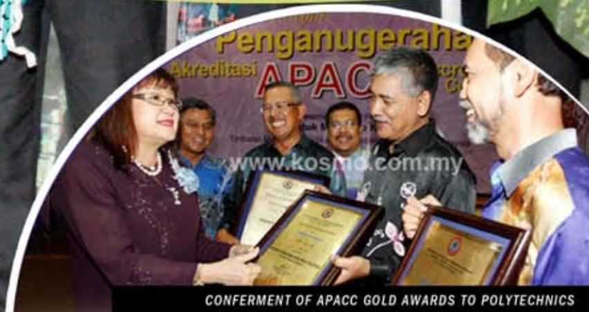
CONFERMEN OF APACC GOLD AWARDS TO POLYTECHNICS