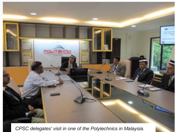
CPSC delegates' visit in one of the Polytechnics in Malaysia.

The CPSC-arranged benchmarking activity of the member countries proved to be fruitful as energetic sharing of vital learnings, experiences, outputs and suggestions for enhancement of each TVET systems was undertaken.