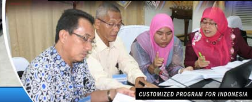
CUSTOMIZED PROGRAM FOR INDONESIA