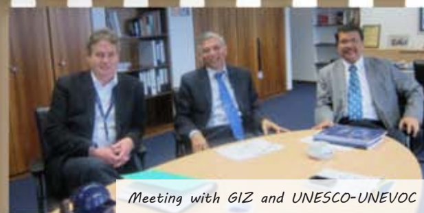
Meeting with GIZ and UNESCO-UNEVOC