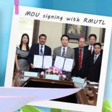
MOU signing with RMUTL