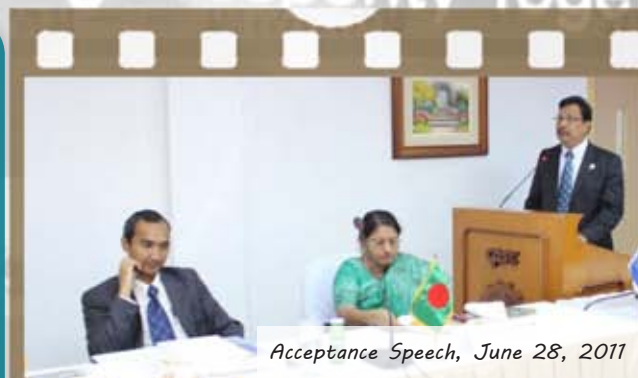
Acceptance Speech, June 28, 2011