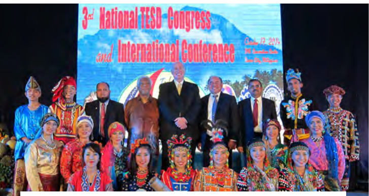
CPSC Faculty Consultants with other guests and cultural performers during the congress.

arking the first collaborative venture in fulfillment of the Memorandum of Agreement (MOA) signed on October 3, 2014, the Colombo Plan Staff College for Technician Education (CPSC) with the Technical Vocational Schools and Associations of the Philippines (TEVSAPHIL), Technical Education and Skills Development Authority (TESDA) and MinTVET (Mindanao TVET), successfully conducted the 3rd National Technical Education and Skills Development (TESD) Congress and International Conference on October 17, 2014 at the SMX Convention Center in Davao, Philippines.