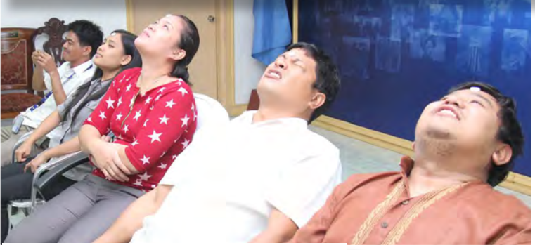
Parlor games filled the day of the yearend gathering.