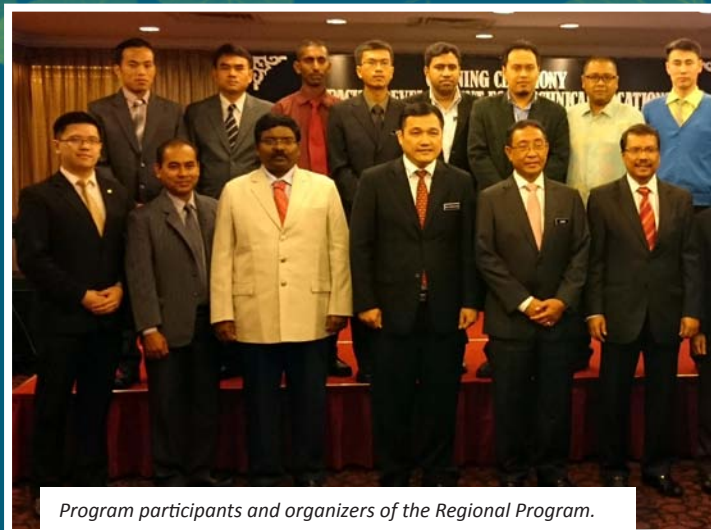
Program participants and organizers of the Regional Program.

T he orientation of TVET towards high technology and hybrid skills, particularly in the field of automotive servicing, is crucial in today's workforce. It forges interest in the sector and promotes the development of important skills that is necessary in addressing globalization and integration of economies.