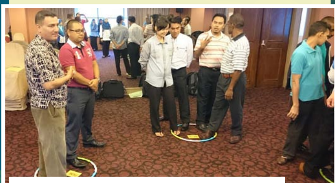
Program participants in one of the tasks during the program.