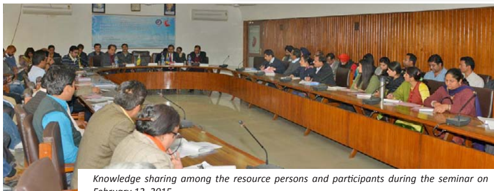
Knowledge sharing among the resource persons and participants during the seminar on February 12, 2015

The program covered an extensive and comprehensive number of lectures and topics such as: (1) Concepts, Principles and Components of the Blue Ocean Strategy; (2) Blue Ocean Strategies for Technical Entrepreneurship Development; (3) Integrating