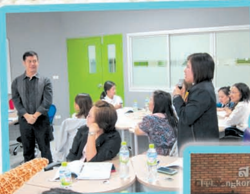
Special Program in Thailand