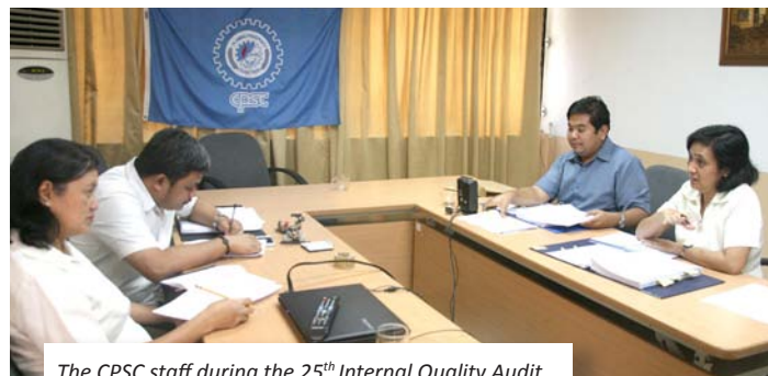
The CPSC staff during the 25 th Internal Quality Audit.

The 25th Internal Quality Audit (IQA) regularly done twice every fiscal year by the Colombo Plan Staff College (CPSC) was successfully carried out this period from February 17-18, 2015. Notable continual improvements and zero-non conformity with few observations highlighted the 25th IQA.