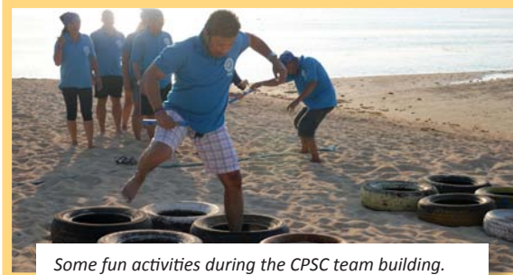
Some fun activities during the CPSC team building.