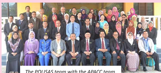
The POLISAS team with the APACC team.

The institution was evaluated based on the following criteria: (1) Governance and management; (2) Teaching and learning; (3) Faculty and staff; (4) Research and Development; (5) Extension, consultancy and linkages; (6) Resources and (7) Support to Students.