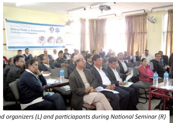
Program Participants and organizers (L) and participants during National Seminar (R)

The economic system of Nepal has undergone a dramatic transformation in the last decade, with its demographic advantage of a growing number of youth, in comparison with the aging societies in most of the more advanced countries in the region. In spite of a remarkable growth in the recent past, a growing body of evidence also points to serious concerns, which include growing incidences of youth unemployment and quality of TVET related issues that require urgent action to help Nepal to sustain its progress and make significant achievements.