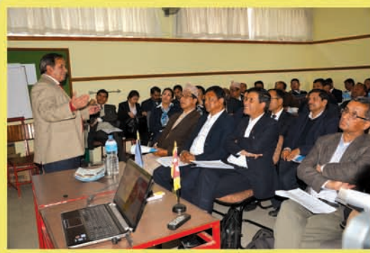
National Seminar in Nepal