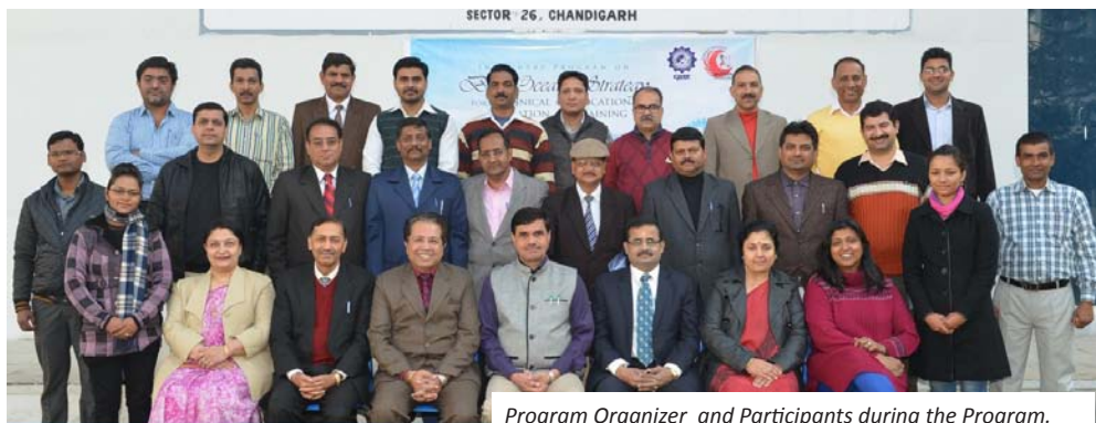
Program Organizer and Participants during the Program.

W ith the emerging need of further advocating the improvement of TVET institutions through methods that encourage innovation and market strategy, the Colombo Plan Staff College (CPSC), in cooperation with the National Institute of Technical Teachers' Training and Research (NITTTR), organized the In-Country Program on Blue Ocean Strategy in TVET held at the NITTTR Campus in Chandigarh, India from February 9-13, 2015.