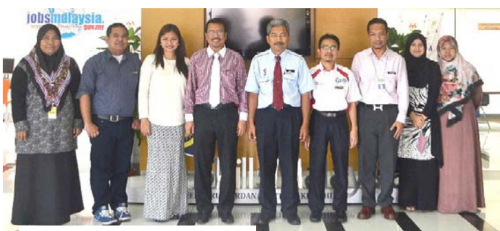
The CPSC team with the CIAST team.