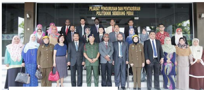
APACC team with DSF faculty and staff.