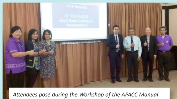
Attendees pose during the Workshop of the APACC Manual in Nakhonpathom, Thailand

OVEC Intensifies APACC...continued from p.15