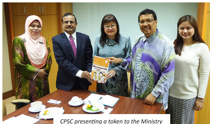
CPSC presenting a token to the Ministry