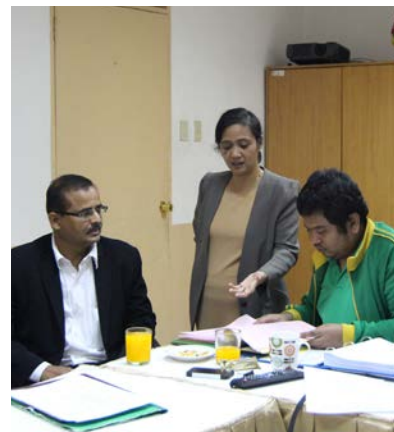
(Photos L-R) CPSC takes closer look into their quality systems and processes during the 26th IQA.

learn that CPSC has been providing such programs. The meeting also led to discussions on strategies that would strengthen APACC's role in improving the delivery of TVET programs and facilitating workforce mobility in the region.