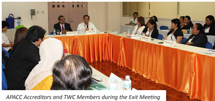
APACC Accreditors and TWC Members during the Exit Meeting