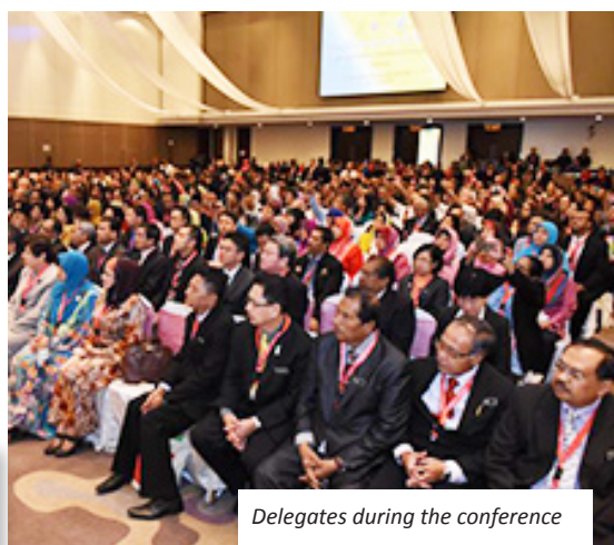
Delegates during the conference