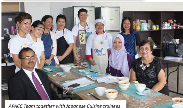
APACC Team together with Japanese Cuisine trainees