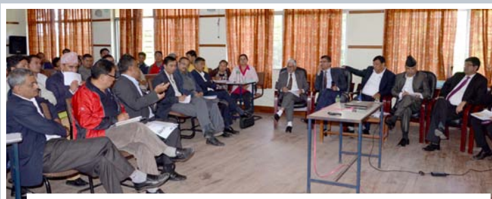
The participants during the seminar