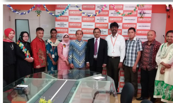
Visit to ICT Academy