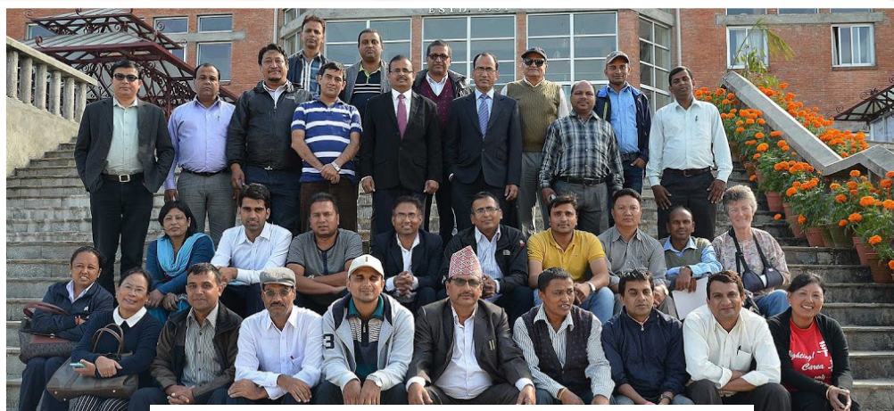
Program participants with the organizers during their visit at the Kathmandu University

T he Colombo Plan Staff College (CPSC) and the Government of Nepal through the Council for Technical Education and Vocational Training organized an In-Country Program on Capacity Building in Research and Development in TVET. The program was held from October 24-28, 2016 at the Council for Technical Education and Vocational Training (CTEVT) in Kathmandu. A total of 40 trainers, administrators and TVET practitioners attended the program.