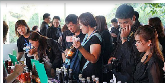
The participants during their lecture and their outdoor classroom activities in which they sampled some local products from technopreneurs.