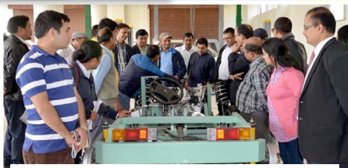
The participants during the study visit

The program was organized with the view that research and development is an investment in a company's or organization's future.