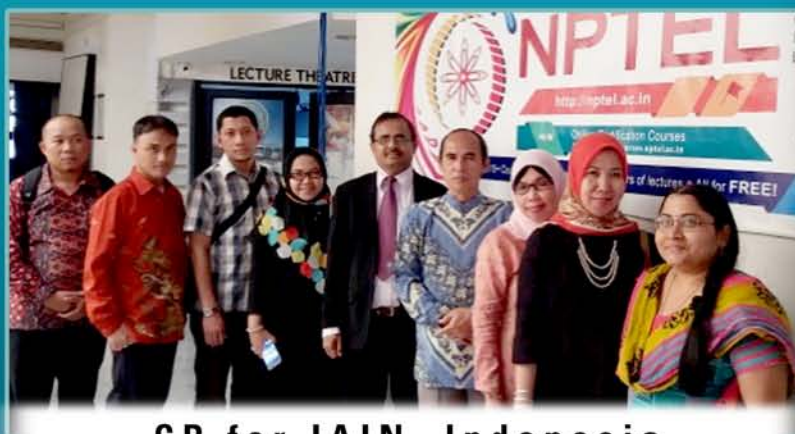
CP for IAIN, Indonesia