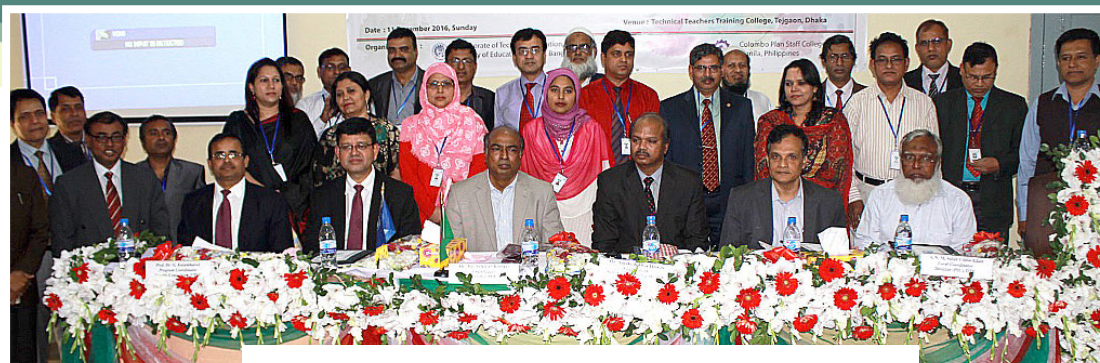
CPSC and DTE Officials at the Program's Inaugural Ceremony

T he Colombo Plan Staff College (CPSC) facilitated a program focusing on the technicalities of industry-institution collaboration and partnership in Bangladesh at the Technical Teachers' Training College in Dhaka from December 11-15, 2016. The program, in partnership with the Madrasha Education Division of the Ministry of Education, was attended by 45 TVET academicians from all over the country.