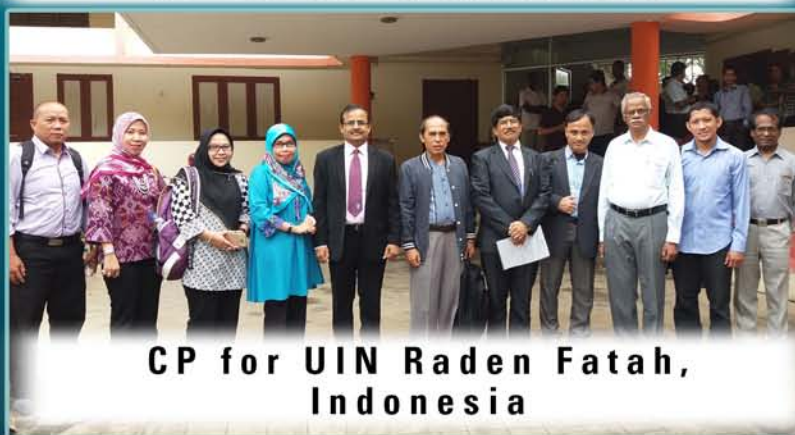
CP for UIN Raden Fatah, Indonesia