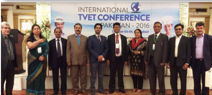
Organizers and Speakers of the International TVET Conference Pakistan - 2016

In view of promoting TVET reforms in an international level, the National Vocational and Technical Training Commission (NAVTTC), in collaboration with the TVET Reform Support Programme, organized a two-day program, titled International TVET Conference 2016 held in Marriot Hotel, Islamabad, Pakistan from October 3 to 4, 2016.