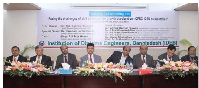
IDEB and CPSC Officials in the Discussion Meeting Ceremony

The meeting drew up vital agreements and affirmations of support from IDEB, CPSC's honorary member organization since 2014. It also touched on ways how to address emerging challenges of skill shortages in the member countries, as well as the enhancement of TVET's role in accelerating economic growth and sustainable development.