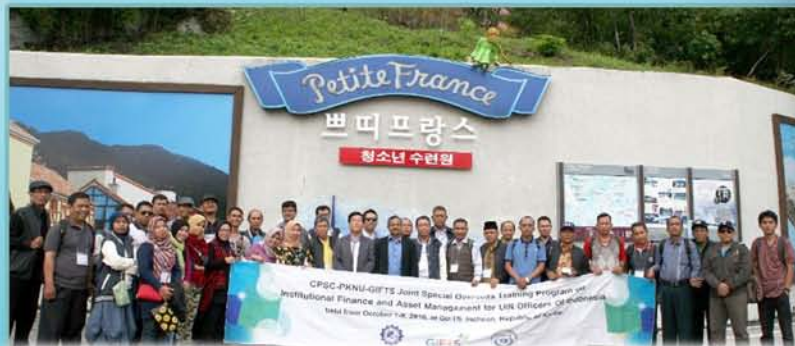
CP for UIN, Indonesia