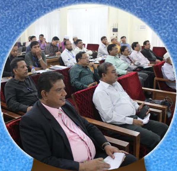
National Seminar in Bangladesh