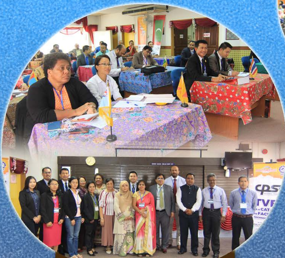
Regional Program in Malaysia