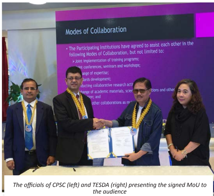
The officials of CPSC (left) and TESDA (right) presenting the signed MoU to the audience

D emonstrating the commitment of CPSC in further contributing the TVET development in the member countries, particularly the Philippines, CPSC signed a Memorandum of Understanding (MOU) with the Technical Education and Skills Development Authority (TESDA) and the National TVET Trainers Academy held during a special ceremony at TESDA's Headquarters in Taguig City, Philippines on December 7, 2017.