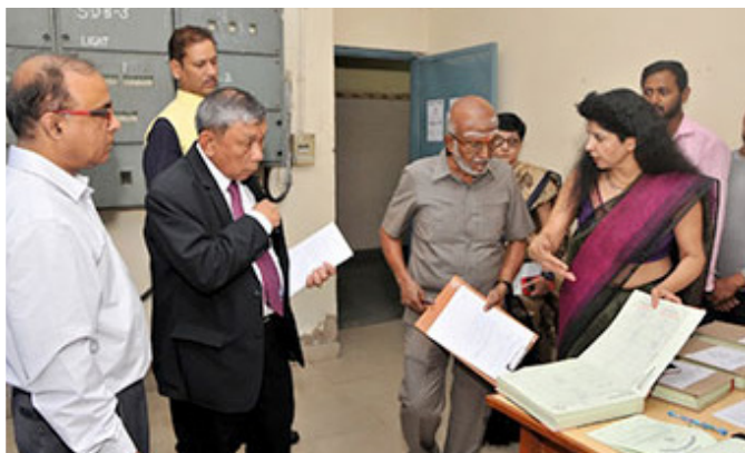
Reviewing the documents during the onsite visit to Ambedkar Institute of Technology