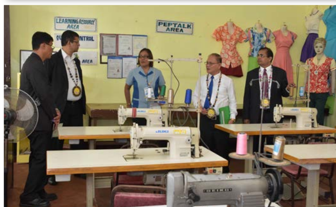
The APACC team inspecting the garments classroom in SNSAT