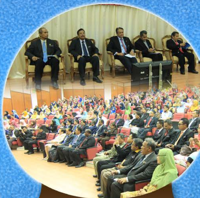
International Conference in Malaysia