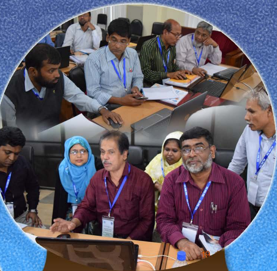
In Country Program in Bangladesh