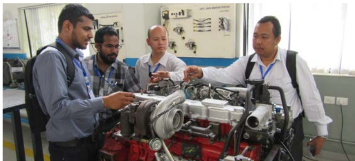
The participants check on training laboratory equipment during the study tour to Dr. Sudhir Chanda Sur Degree Engineering College