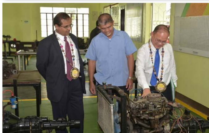
APACC Accreditors during the tour of the automotive workshops