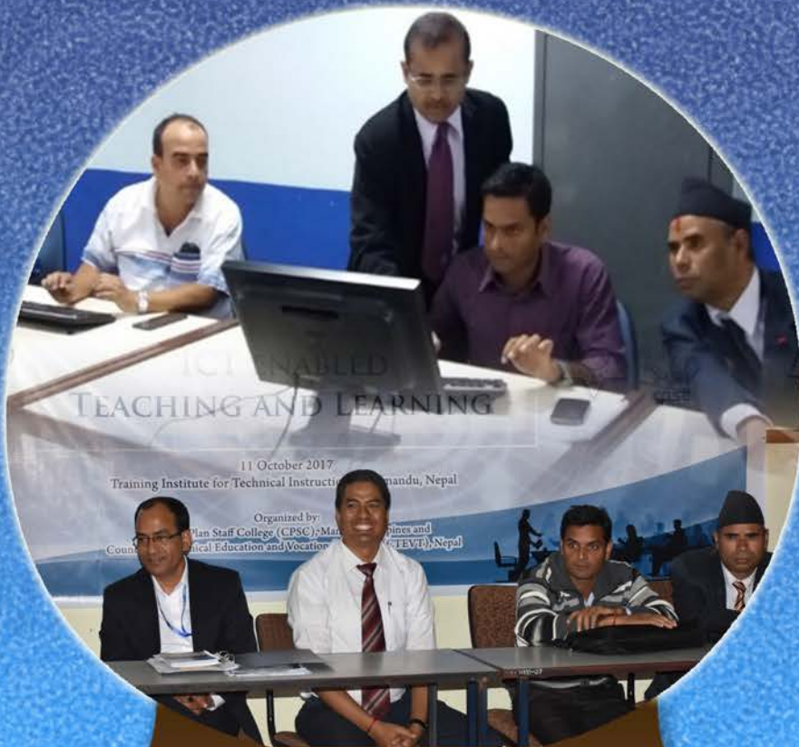
In Country Program in Nepal