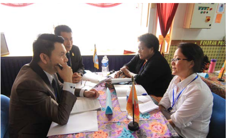
Participants discuss with one another on the different strategies on technopreneurship during the Regional Program classroom activities