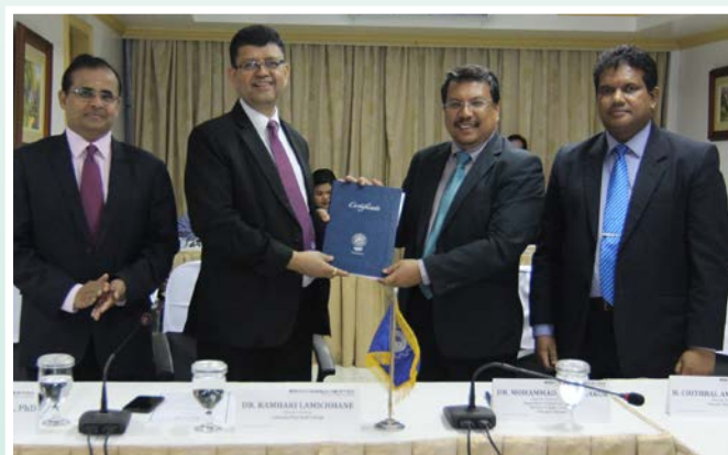
Presentation of the SEC report by the Director General (second from the left) and the head of the Senior Executives Conference delegates