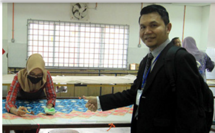
A participant from Thailand observing a student crafting handmade "batik" at UiTM