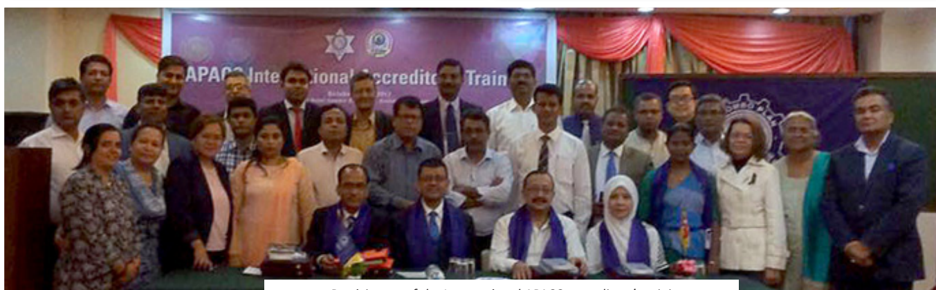
Participants of the International APACC accreditors' training