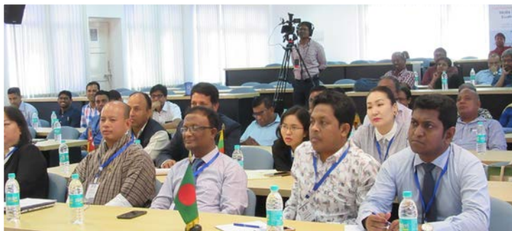
The participants of the Regional program listening to the lectures