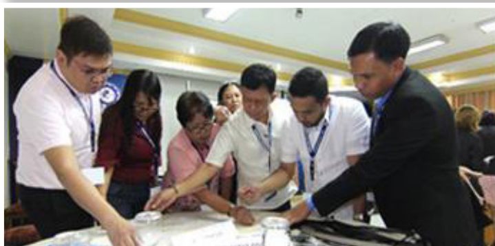
The participants showing their skills and knowledge in the tasks prepared by CPSC