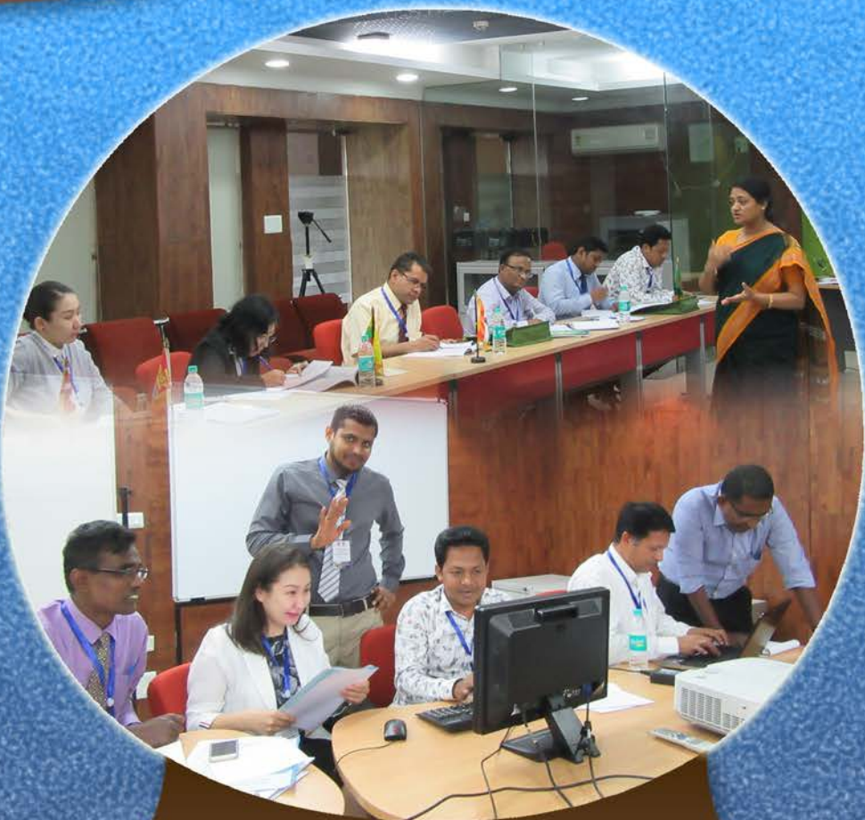
Regional Program in India