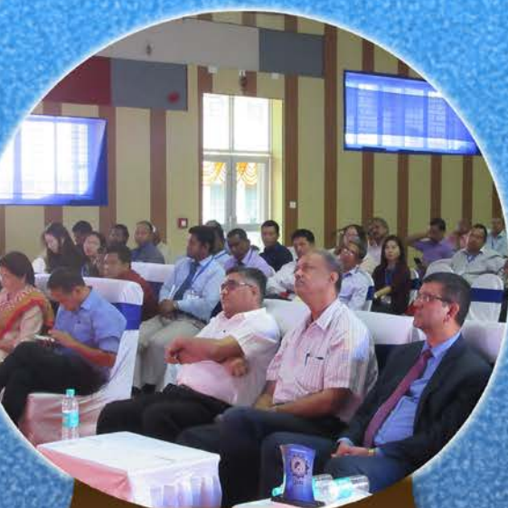
International Seminar in India