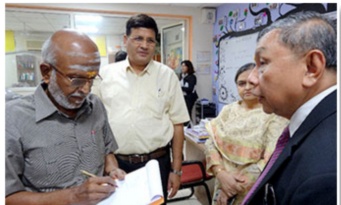
Onsite Visit to Bhai Parmanand Institute of Business Studies (BPIBS)

The last to be visited was Bhai Parmanand Institute of Business Studies (BPIBS), a public technical college established in 1986 under the Government of NCT of Delhi. It was formerly known as "Institute of Commercial Practice" in 1972, which mainly conducted vocational courses in the area of office management and secretarial practice. At present, apart from Diploma and Bachelor Courses related to TVET, the institution also offers Master Programs in Computer Application and Business Administration. BPIBS has been selected as one of the top 10 institutes among 4800 institutes in India for Vittiya Saksharata Abhiyan (Financial Literacy Campaign) at national level based on the work done in spreading awareness about Digital Financial Literacy and bringing people on digital platform. It garnered the Best Academic Infrastructure 2017 at Students' Choice Awards 2017.