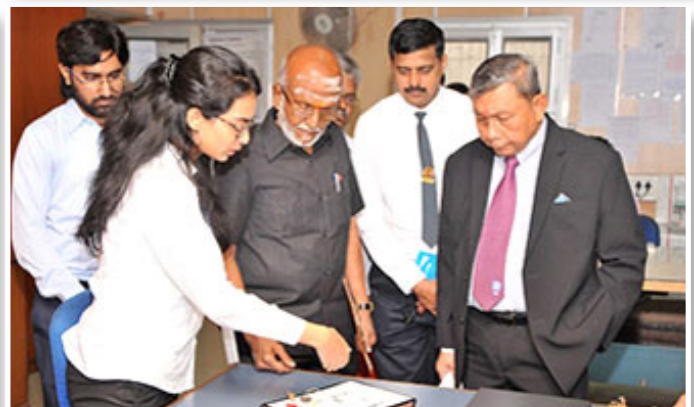
Assessing the laboratories at Jija Bai Industrial Training Institute for Women