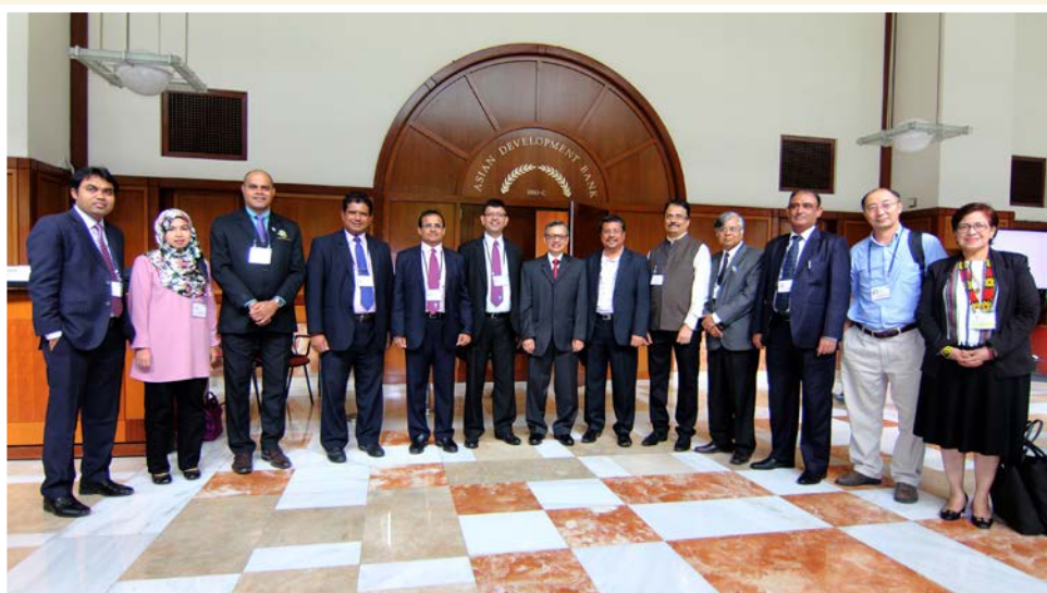
Some CPSC participants in the Senior Executives' Conference also attended the ADB Conference.