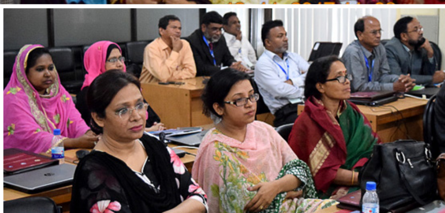
Some women participants during the program listening attentively to the speaker

The Colombo Plan Staff College (CPSC) facilitated a program focusing on the Image-Building Mechanism and Strategies in TVET in Bangladesh at the Technical Teachers' Training College (TTTC) in Dhaka from November 19-23, 2017. The program, which was organized in partnership with the Directorate of Technical Education (DTE), was attended by 45 TVET administrators from all over the country.