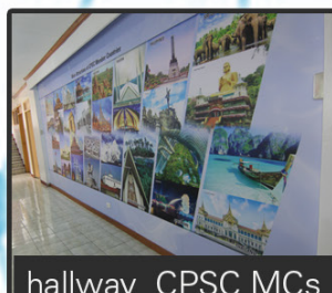
hallway CPSC MCs