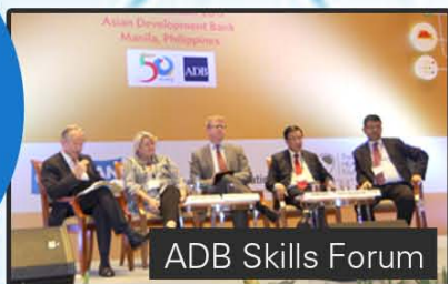
ADB Skills Forum

Special Programs with Partner Institutions reached 907 participants