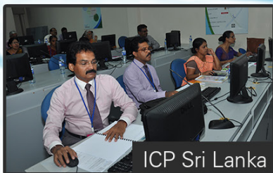
ICP Sri Lanka