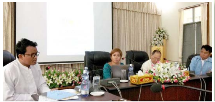
Some of the invited guests from Myanmar's TVET sector and industry partners sharing their insights during the National Seminar.

Another highlight of the program is the one-day National seminar on Quality Assurance in TVET: Emerging Challenges and Fresh Perspectives held on 08 May 2018. The purpose of the seminar was to create a platform for academicians and practitioners to exchange research-based and experience based insights on issues, addressing the radiant transitions in the TVET system in the context of Myanmar.