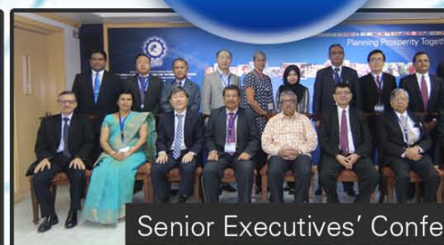
Senior Executives' Confer