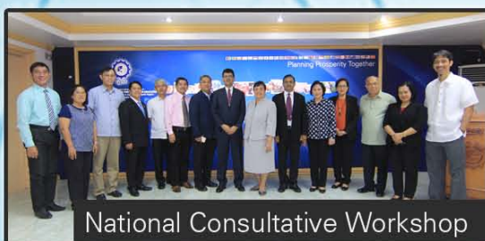
National Consultative Workshop

Consultative Meetings crafted CPSC's Strategic Plan 2018-2023