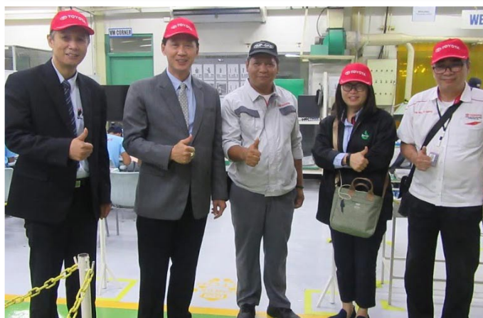
IRPC Officials visit Toyota Technology Center in Santa Rosa, Laguna.

IRPC Technological College is considered as one of the leading private technical colleges in Thailand that is directly affiliated with one of its major petrochemical and industrial companies, the PTT group. It is considered as one of the model institutions in ASEAN in developing the competencies and skills of the graduates in preparing them for a career in heavy industry. It is also considered as a center for excellence in technical education not only in Thailand but in neighboring countries such as Myanmar, Cambodia, Laos and Vietnam.