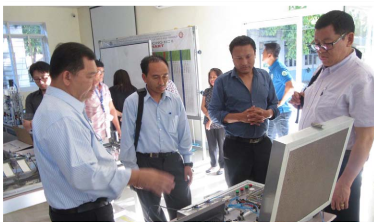
Bhutanese officials inspecting the facilities of TESDA Women's Center (TWC) during their visit to the institution.