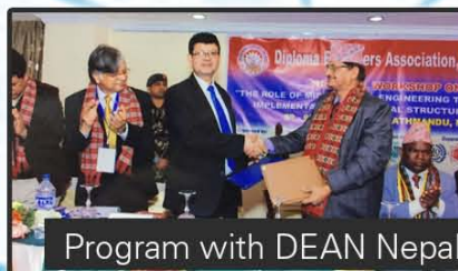
Program with DEAN Nepal